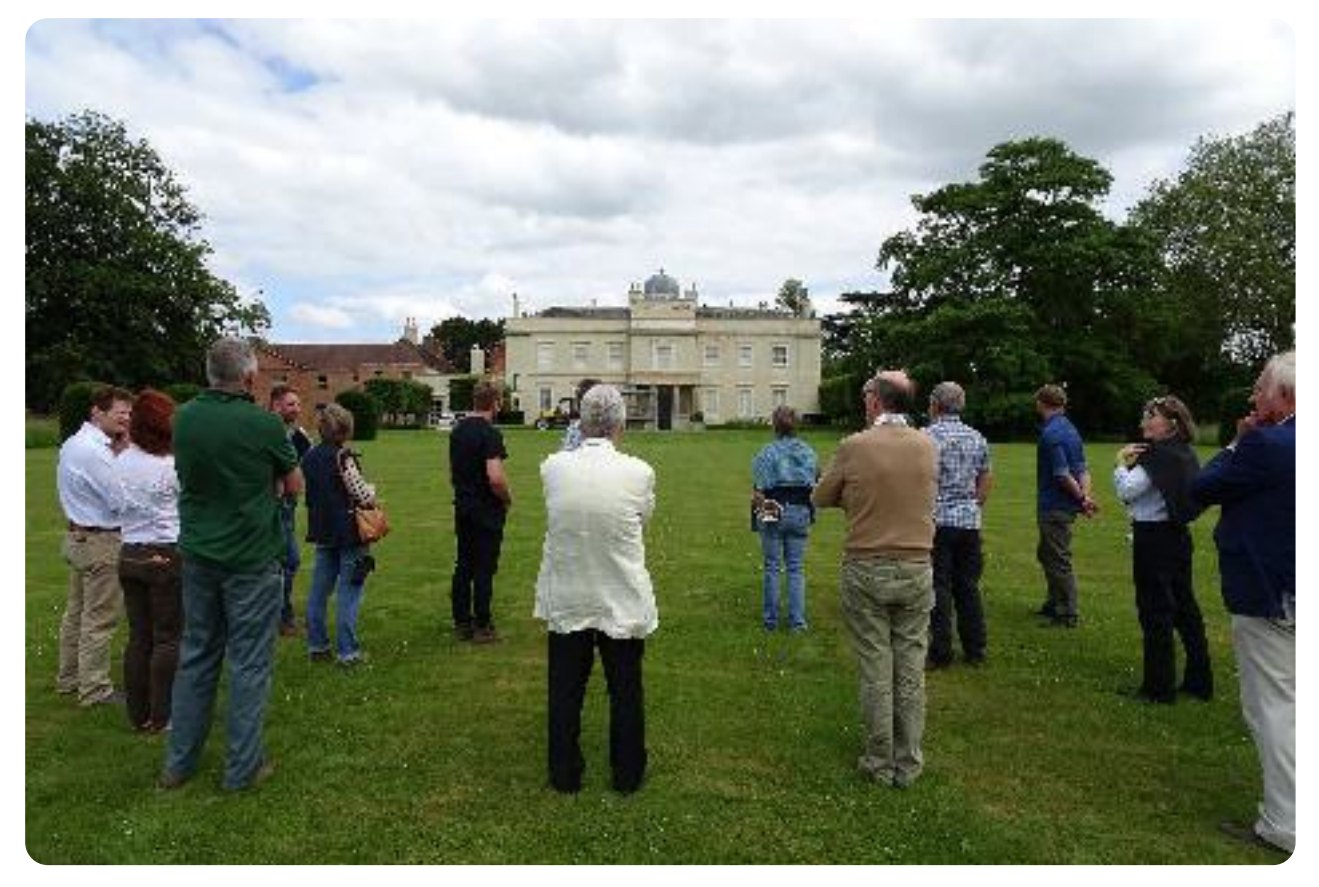
Land manager's event, Bromesberrow Place.

3.13 The National Landscape is an inspiring place where culture, heritage, and the natural environment is celebrated. Natural beauty is conserved so that the landscape is valued and loved by all. The connection to natural beauty provides healing, health and happiness. Everyday connections to a nature-rich world are commonplace and valued. The cultural and historic environment is in good condition, valued, celebrated and better understood by residents and visitors alike. The towns and villages are vibrant and viable centres for the future. Everyone feels a connection to their place and this provides benefit to people's health and wellbeing. There is a high-quality, sustainably designed, built environment that provides residents and visitors with a safe place to meet, live, work, play and connect.