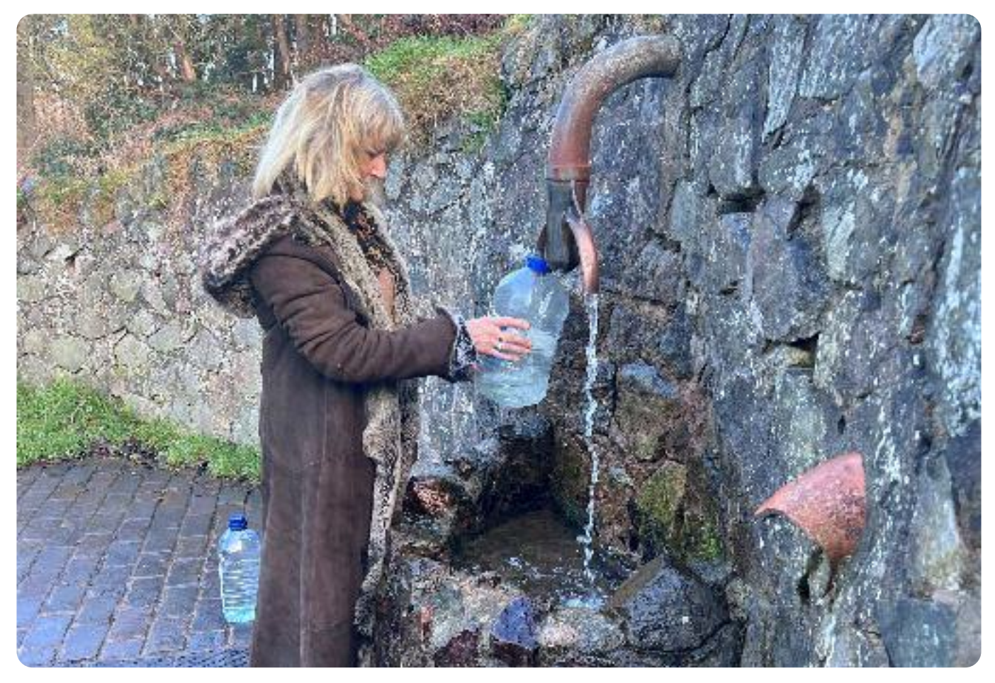
Collecting spring water, Hayslad.