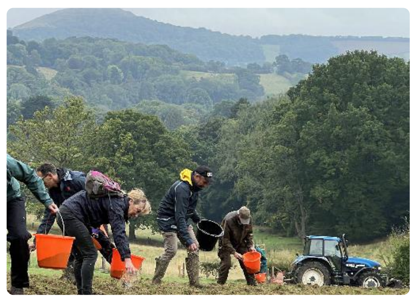
Volunteers restoring a meadow, Upper Colwall.