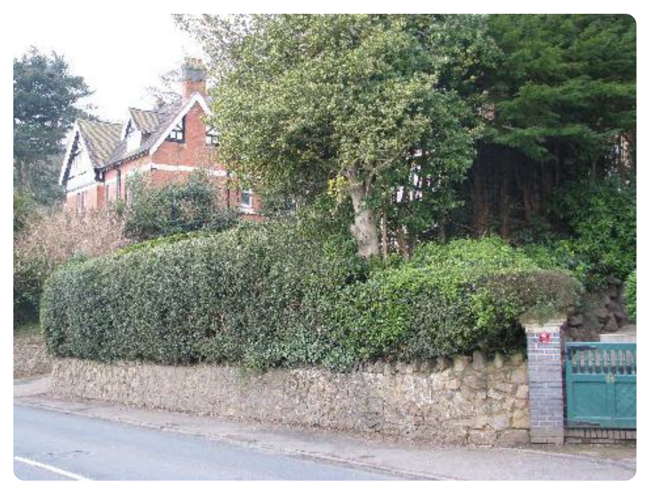
Locally characteristic property boundary, Malvern Wells.