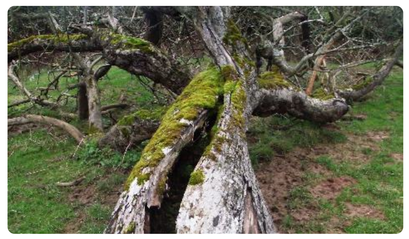
A fallen orchard tree, Mathon.