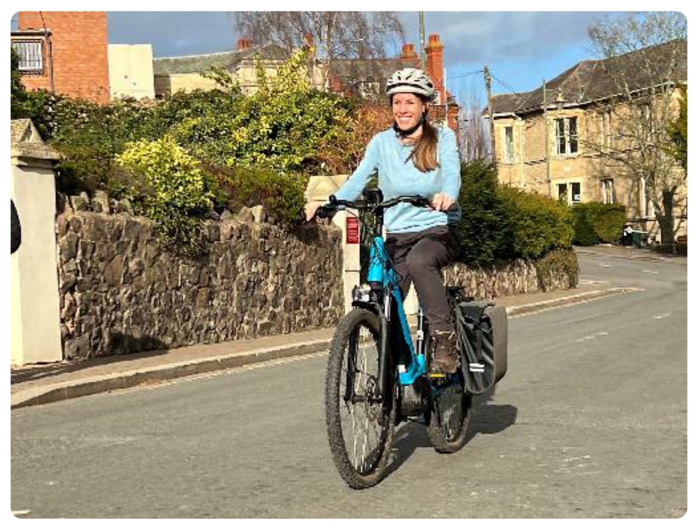
Electric bike hire from Malvern Car Club.

PE4.3 Work in partnership to develop the Malvern Hills as an area for show-casing new tourism technologies including: