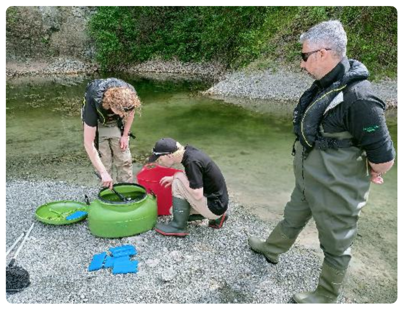
Establishing an ark site for White-clawed Crayfish.

NA1.4 National and local guidance – including guidance from Government Agencies and the Non-Native Species Secretariat – on invasive non-native species, pests and diseases should be followed and appropriate biosecurity measures promoted, for example: