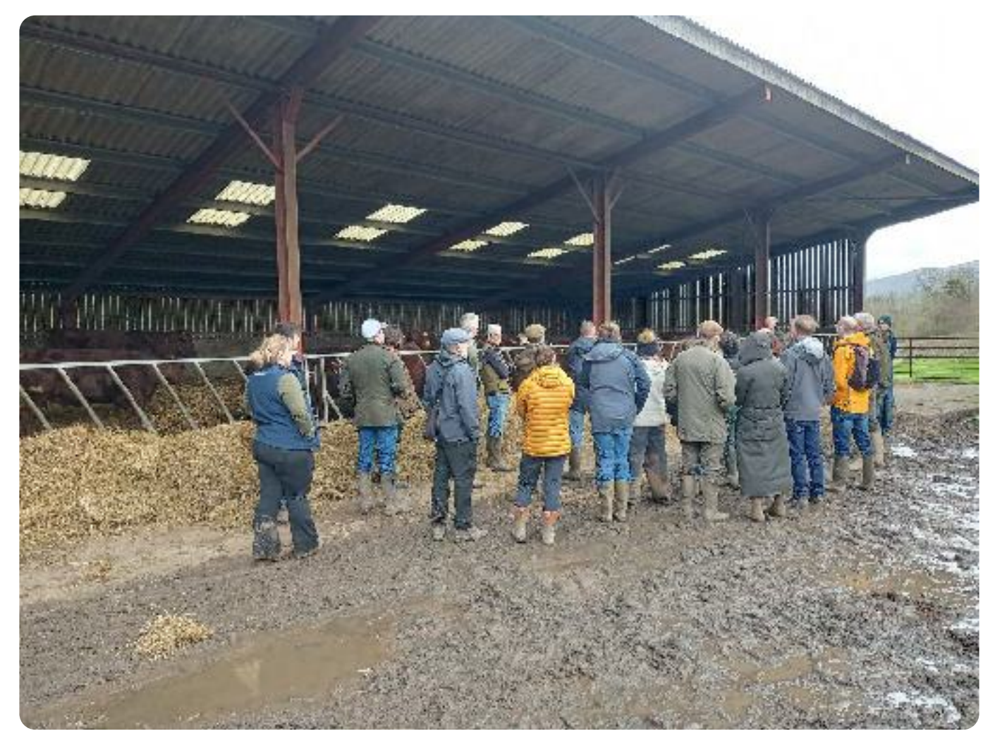
Landowner and manager event, Madresfield.

PE3.2 Support community initiatives that promote the creation and management of key habitats, appropriate renewable energy schemes, energy efficiency, recycling, community transport and community housing where there is evidenced need.