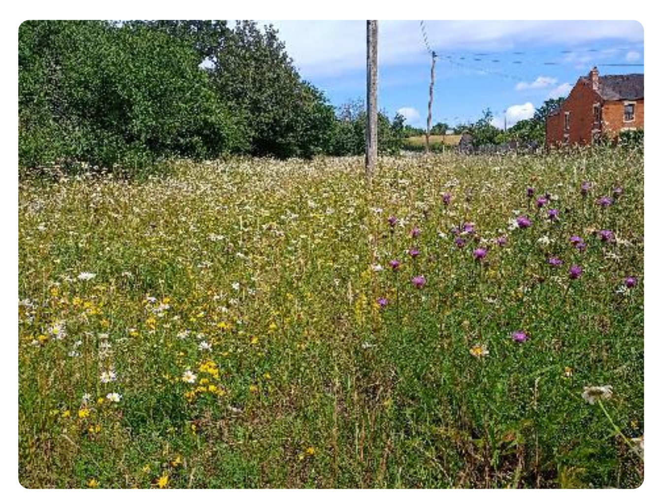
Roadside verge managed for wildlife, Castlemorton.