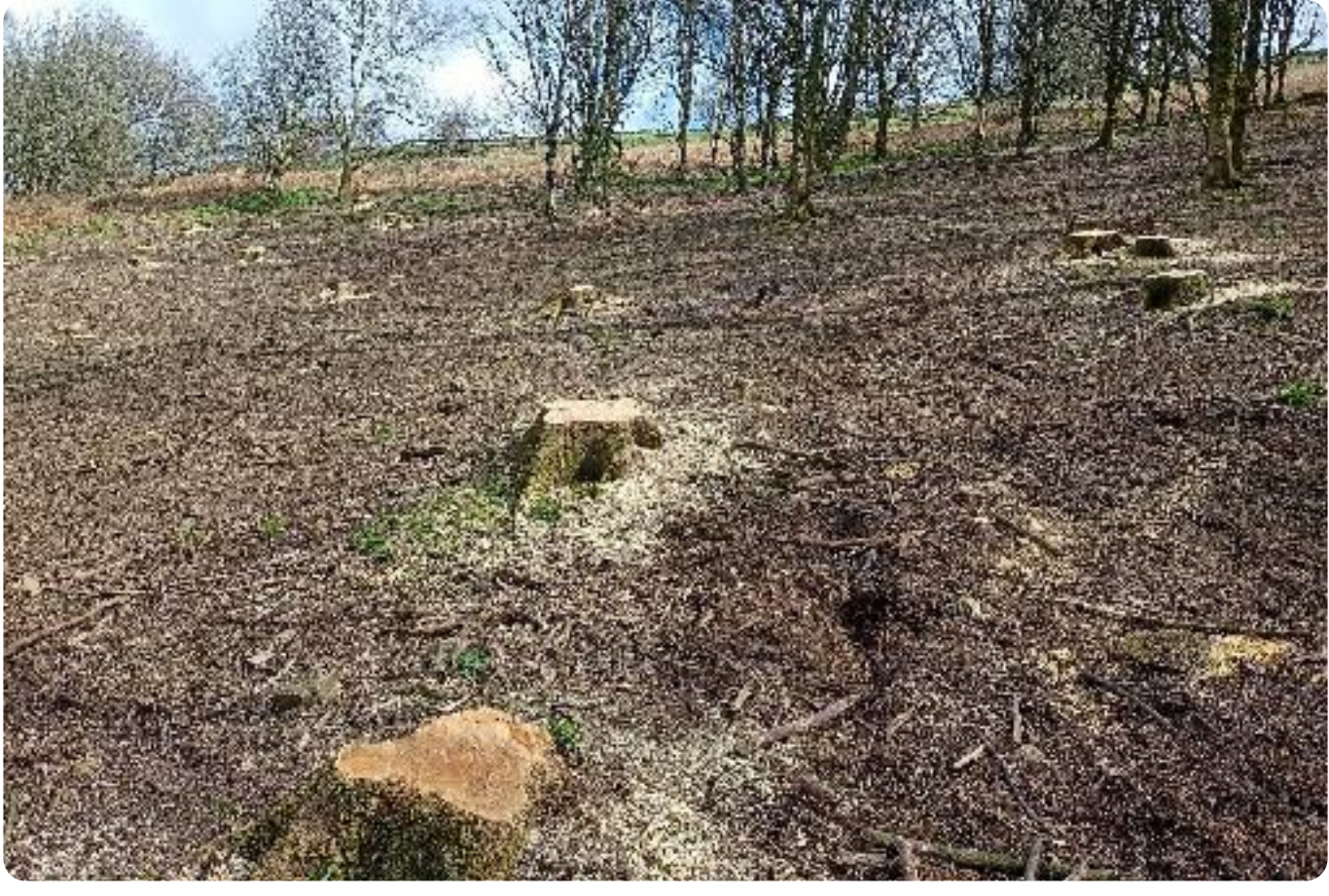
Tree clearance to restore acid grassland, Malvern Hills.

22 Priority habitats and species - The list of habitats and species of principal importance in England is published by Defra (2008) under Section 41 of the Natural Environment and Rural Communities (NERC) Act 2006. Section 40 of the NERC Act places a duty on all public sector bodies to have regard to biodiversity in their work.