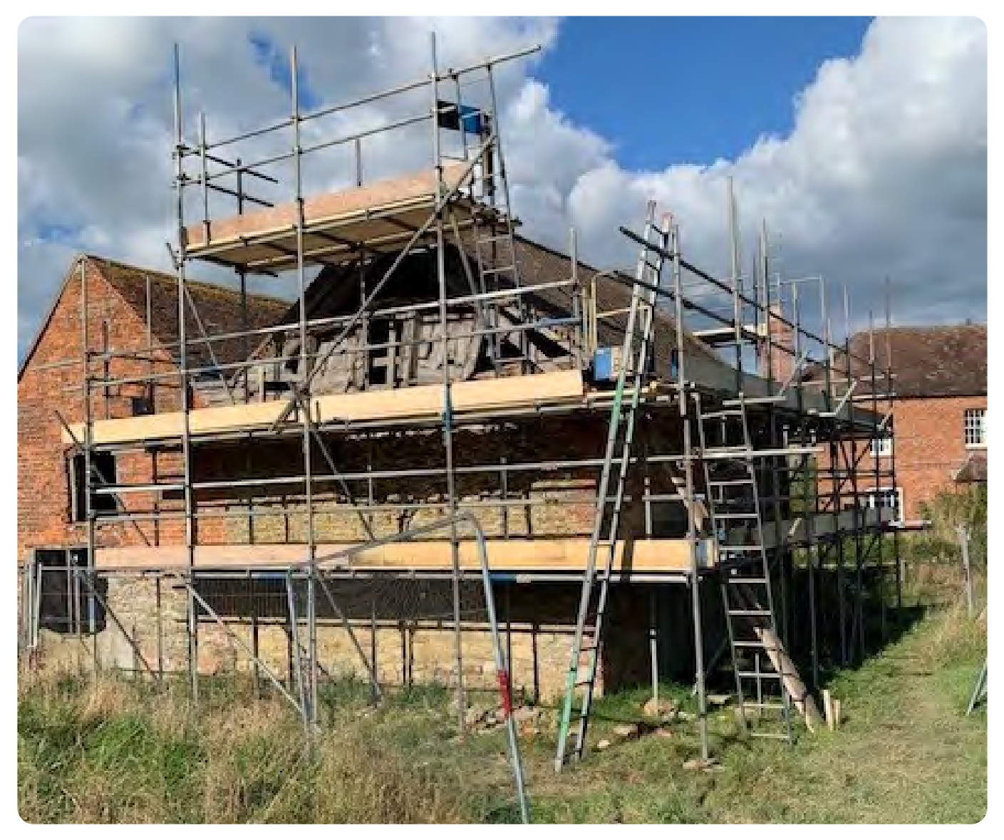
The Granary build being restored under an Historic Builling Restoration Grant, Eastnor.