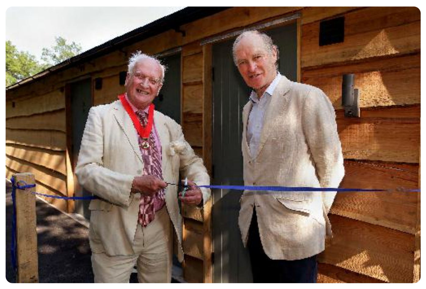
The opening of the new loos, grant funded by Farming in Protected Landscapes scheme, Eastnor Park.