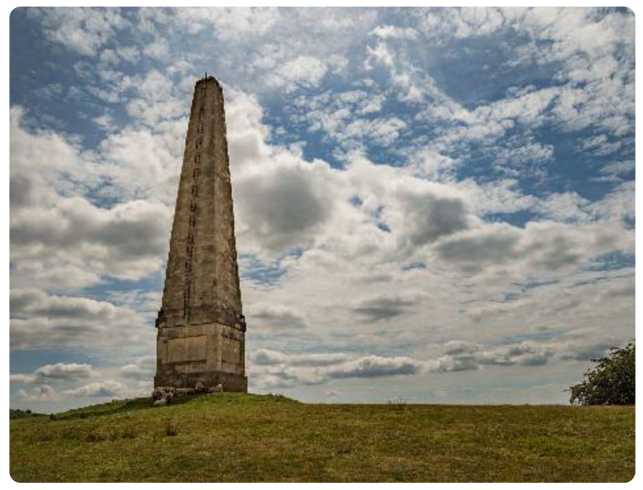
31. The obelisk, Eastnor