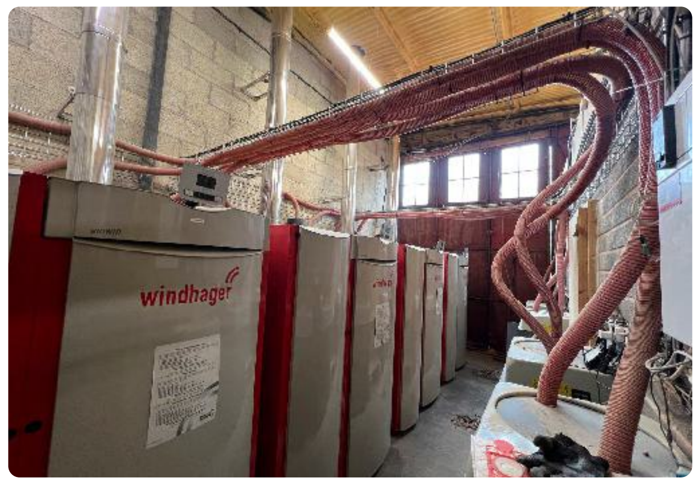
A local biomass boiler using locally sourced fuel, Cowlall.