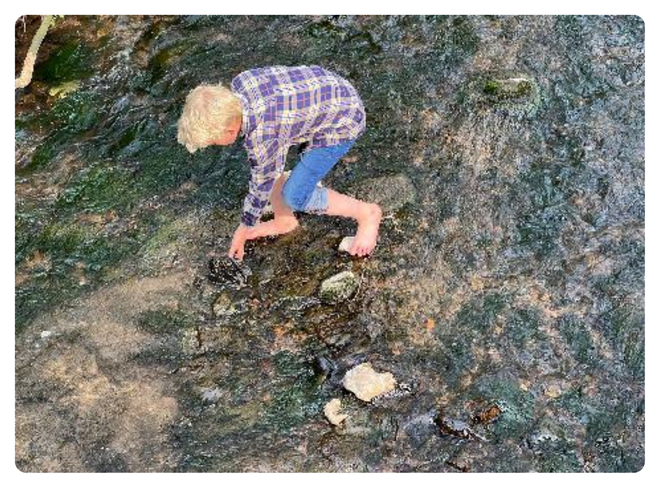
Clean, clear brooks, Mathon.