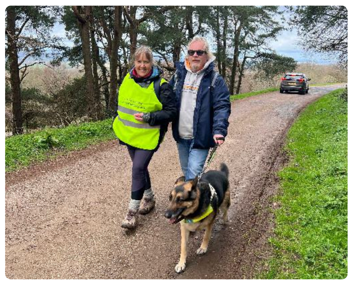
Guided walk for the visually impaired, Malvern Hills.