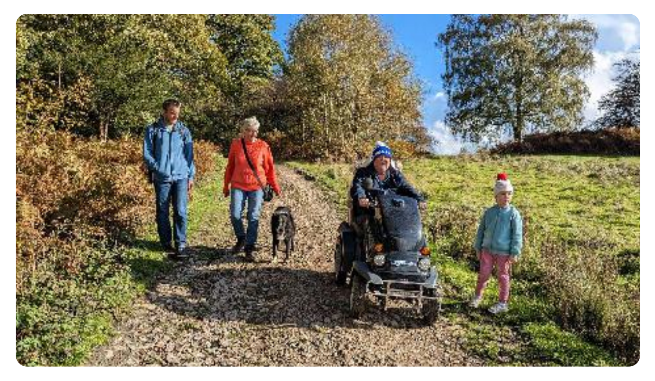
Easy access track, Eastnor Park.

2.13 The impact of these issues on the natural beauty of the Malvern Hills National Landscape were considered during the development of the vision and the outcomes.