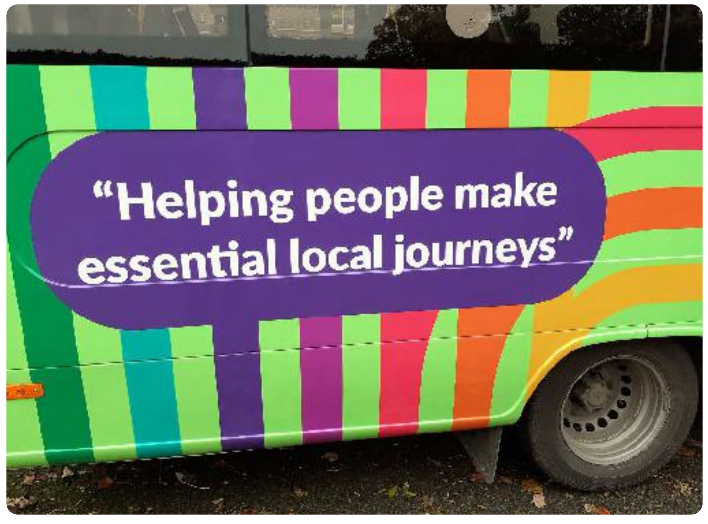
On-demand bus service, Worcestershire.