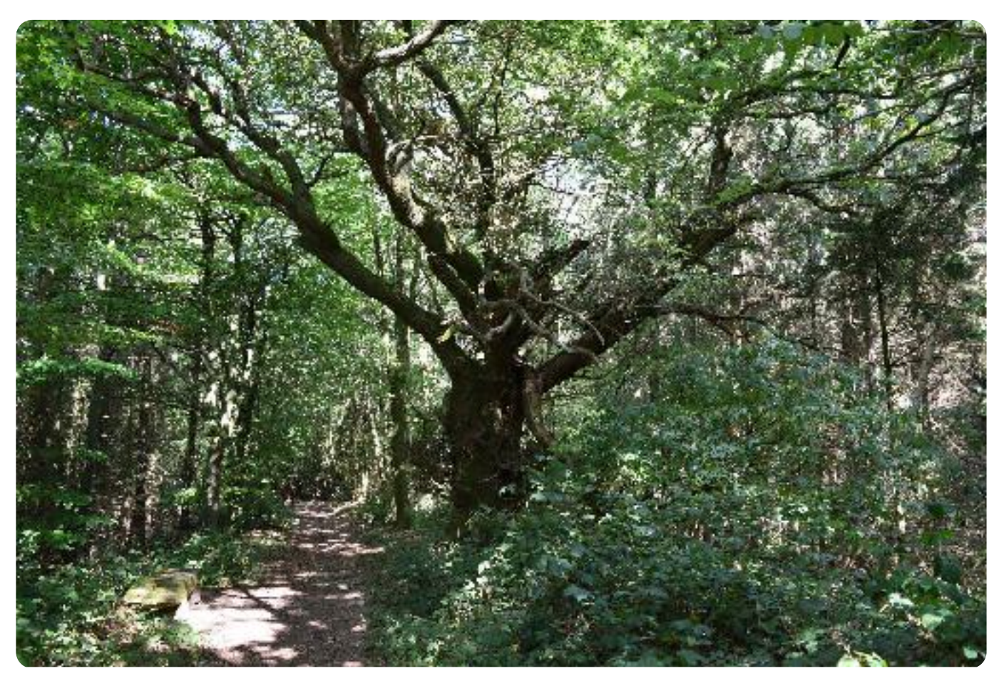
Plantation on Ancient Woodland, Suckley.

7.60 Trees have a huge significance in the National Landscape, contributing to the heritage and rural economy. Trees provide major ecosystem services to society, as well as a direct economic value and social amenity<sup>55</sup>. Trees can also help mitigate climate change by capturing and storing carbon. Woodland covers around 20% of the total National Landscape area. This consists mainly of small broadleaved woodlands on banks, ridges and hilltops, and hedgerows. There are larger woodlands covering more than 100 ha at Eastnor, Storridge/Alfrick and Bromesberrow. Alongside global trading and modifications to climate, new diseases and pests are affecting trees in the National Landscape. Defra has recently published its tree health resilience strategy. This explains how the government will work with others to protect England's tree population from these threats.