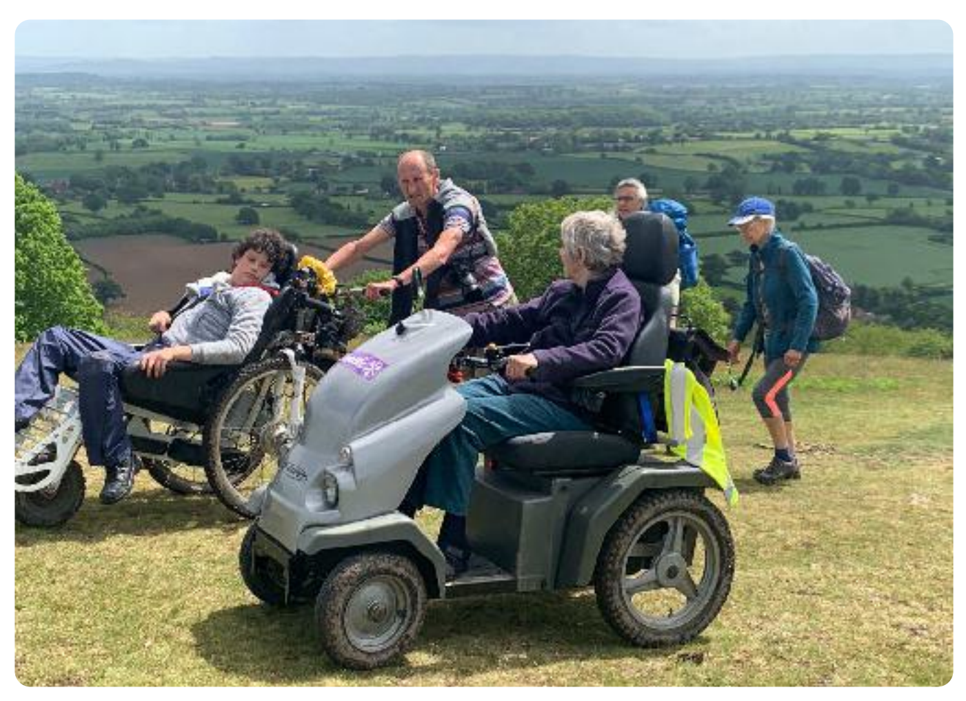
A Tramper expedition on the hills.