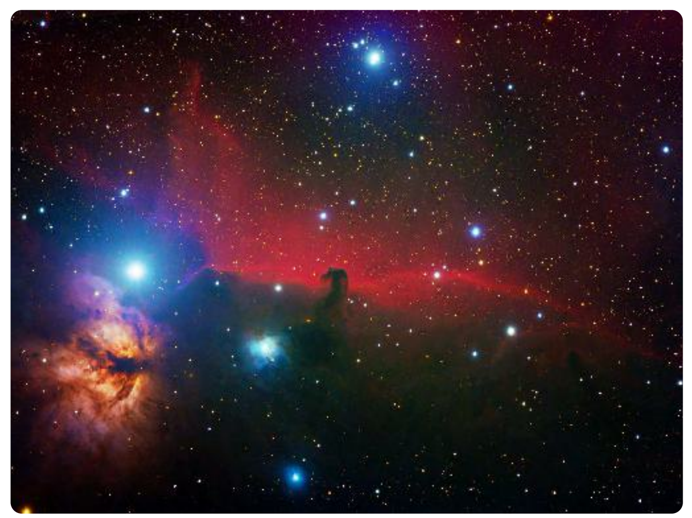
Horsehead and Flame nebula from Suckley.

People can experience calmness and spiritual refreshment within the National Landscape, free from unnecessary noise, light and human induced disturbance.