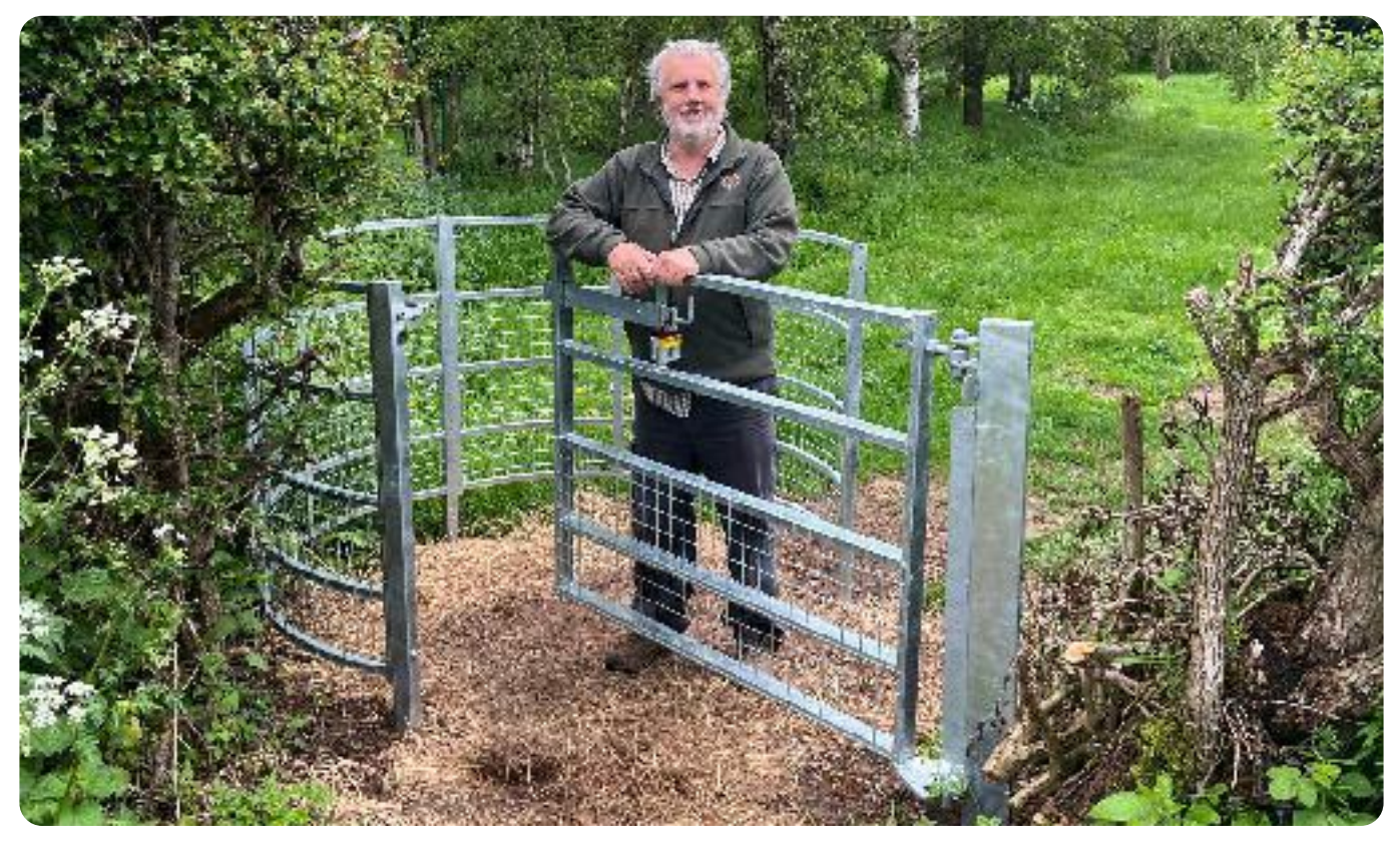
Newly installed access gate, Colwall Village Garden.