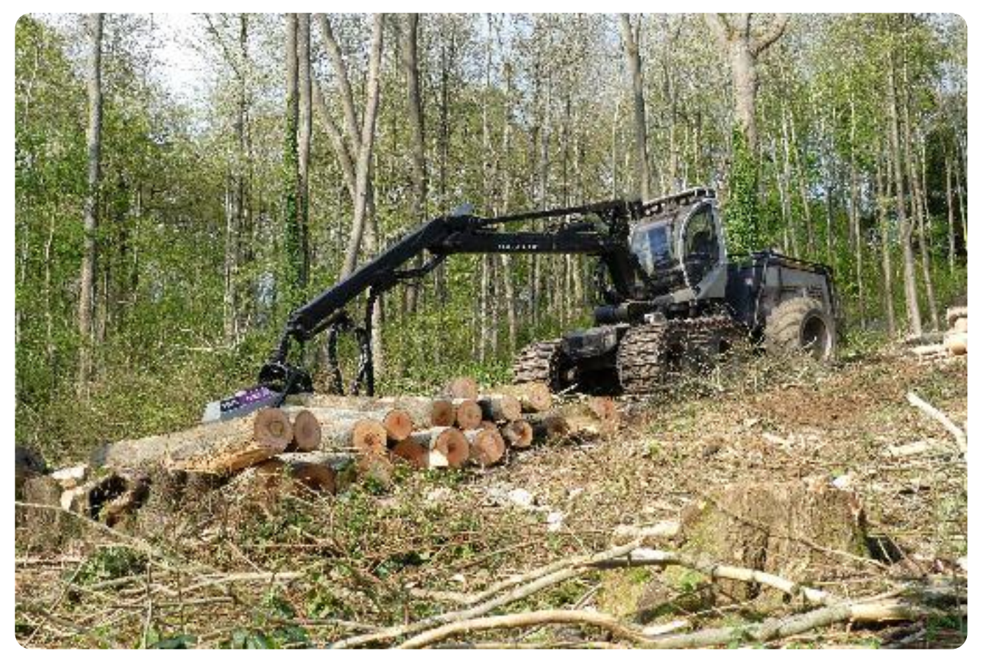
Timber harvester, Cradley.