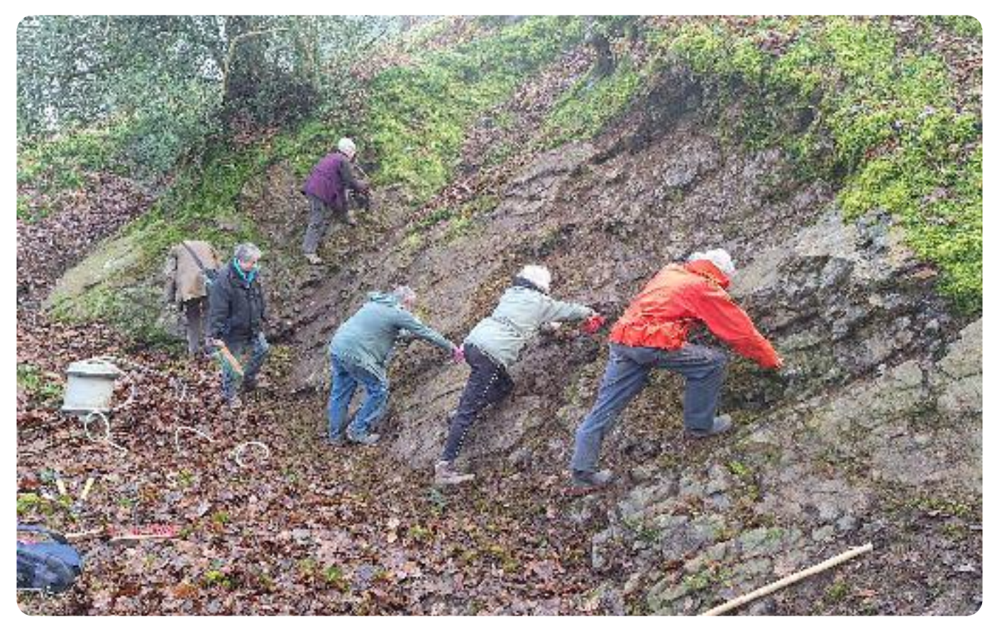
Geovolunteers conserving a geology site.

NA2.2 Understanding of the geological value of the National Landscape should be promoted, including its links with the historic environment and the need for its protection and management. This should be supported by continuing exploration and research into the geology and geomorphology of the area. Relevant authorities should develop policies and adopt decision making for development that seek to protect geological and geomorphological resources and features.