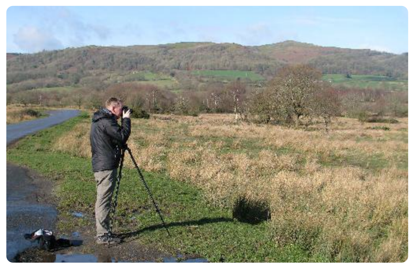
Monitoring landscape change, Castlemorton Common.